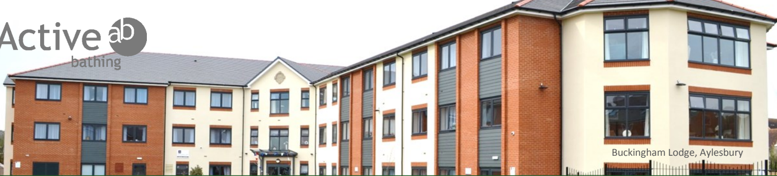
Buckingham Lodge, Aylesbury

“The Compact bath from Active Bathing met all our requirements.”